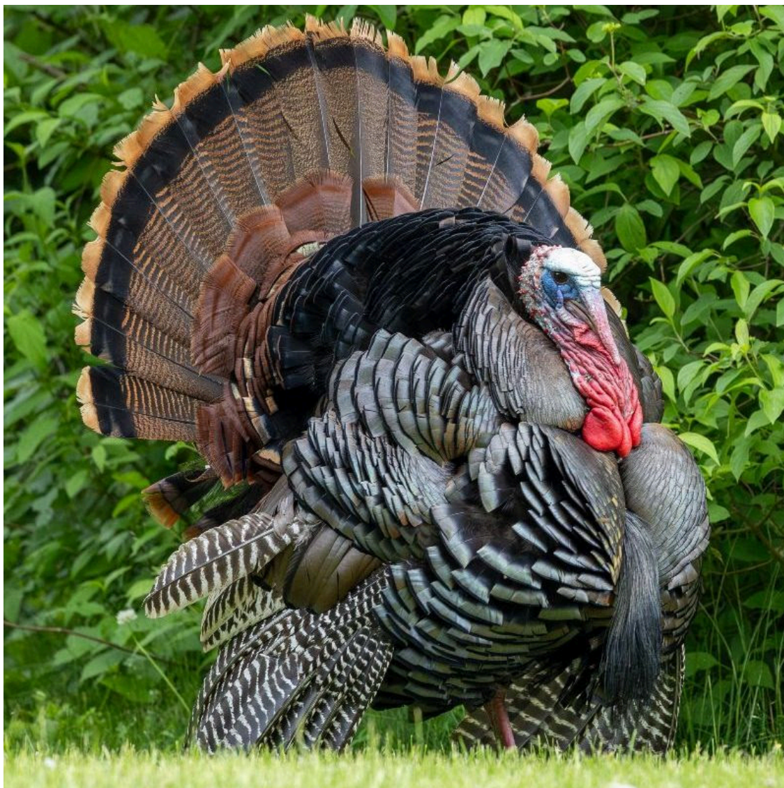
Male Turkey Strutting His Stuff