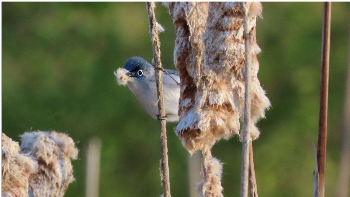
Prepping for a Very Soft Nest, Amy Severino